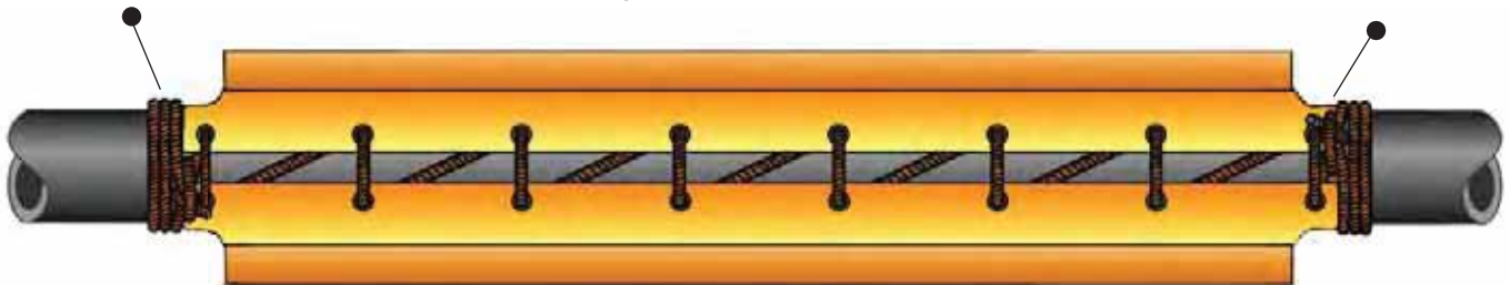
Diagram of recommended method of attachment